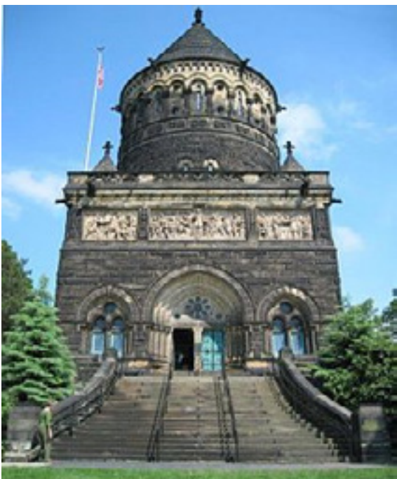
The Garfield Memorial at Lake View Cemetery in Cleveland.

Article submitted by: Marilyn Brandt, Lake View Cemetery