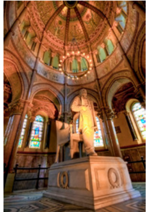
The Rotunda of the Garfield Memorial, featuring much ornate stained glass.

And once done, the famous Garfield Memorial will stand towering over Lake View Cemetery and be available for thousands upon thousands of Clevelanders and visitors from around the world to view and enjoy for many years to come.