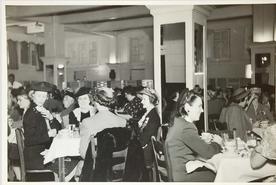
Above Photo: Lunch Room at Young Women's League